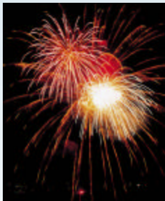
Independence Day (July 4)