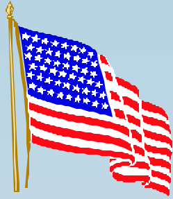
Flag Day (June 14)