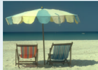
Lazy Days of Summer