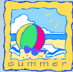
Summer Begins (June 21)